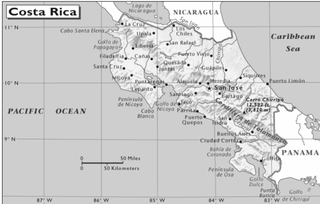
Figure 3. Costa Rica map adapted from Mapquest

No country in the world is more identified with ecotourism than Costa Rica. 1 The country's status as the highest-profile ecotourism destination in the world is intimately tied to its well-developed national park system. 2 If one were looking for a model on which to manage ecotourism in a rainforest environment, Costa Rica would be it. In 1992, the U.S. Adventure Travel Society named Costa Rica the "number one