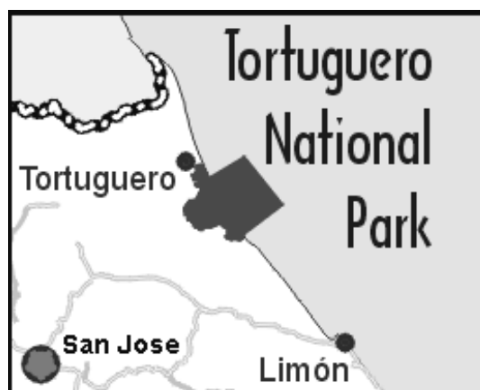
Figure 4. Tortuguero National Park map adapted from Costa Rica Map and Travel Guide website

Currently there are 32 national parks in Costa Rica. One of the most successful and well known is Tortuguero National Park, which extends north along the coast for 22 kilometers from Jaloba to Tortuguero village. Tortuguero, most frequently cited as the example where a national park and ecotourism have worked together to benefit both the cause of conservation and the economic development of the surrounding community, 39 is a textbook model of national park management and development. Tortuguero protects a unique series of natural inland waterways that are home to freshwater turtles, river otters, crocodiles, manatees, and sloths. The area is also where one can